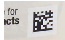
GRADE A SYMBOL EXAMPLE

Note: ISO reports numeric grades but many specifications use letters.