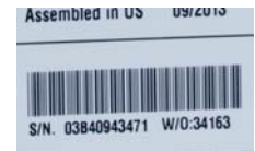
GRADE A SYMBOL EXAMPLE

Note: ISO reports numeric grades but many specifications use letters.