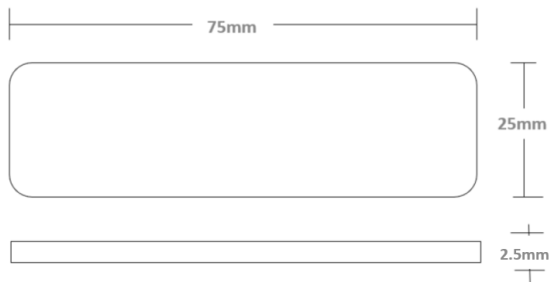
Dimensions stated in mm