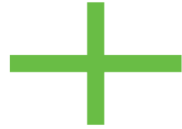
Figure 1. Green Cross LED Aimer